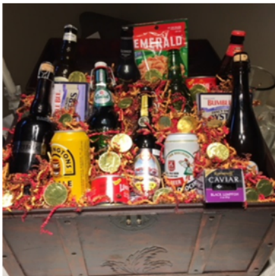
Beers and Ales from around the world and exotic snacks- caviar, smoked oyster, etc.