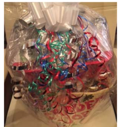
Trader Joe's Basket- Numerous goodies including Famous Trader Joe's Cookie Butter, US Grade A Taste of Vermont Maple Syrup, Himalayan Pink Salt Crystal, Organic Single Estate Ceylon High Grown teas and many more items