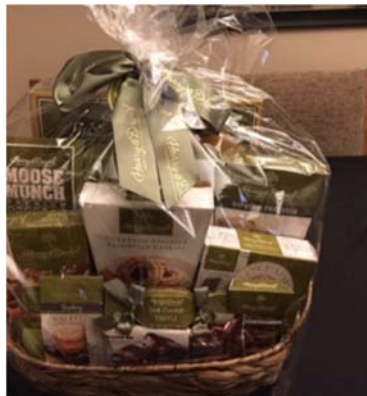
Harry and David's Munchies