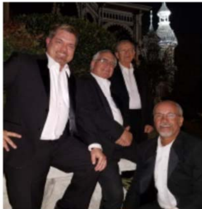
The Flexible Four Quartet of the: