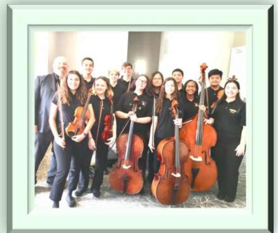
Sergeant Smith Orchestra

Event pictures will be uploaded soon to the branch website for your viewing enjoyment.