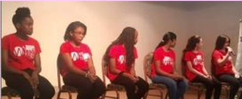
Every Contribution Will Make a Difference!

For many girls, the one-week camp provided the spark that ignites their curiosity in STEM and places them on a path toward success. To support our FL AAUW Tech Trek program, please attend our Annual Fundraiser in February 2020 so that we can raise funds to send deserving young ladies to this important, life-changing camp. Additionally, to make donations supporting an 8 th Grade girl at a 2020 Florida Tech Trek Camp, June 14 th – 20 th at Stetson University in DeLand, Florida and June 21 st – June 27 th at Florida Atlantic University in Jupiter, Florida, see below