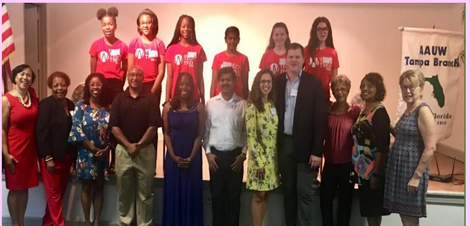
Tech Trek Students, Parents, Interview Team and President