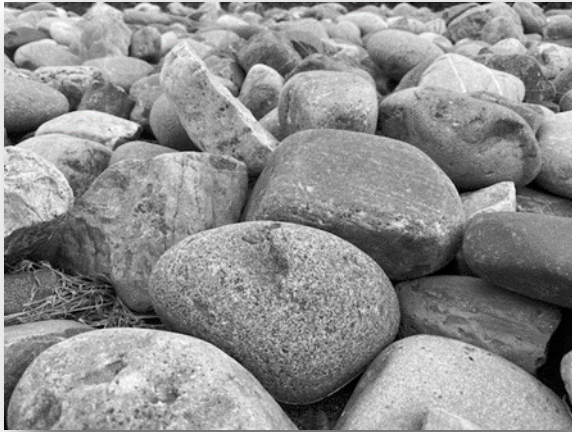
Alesya's – Things around the house